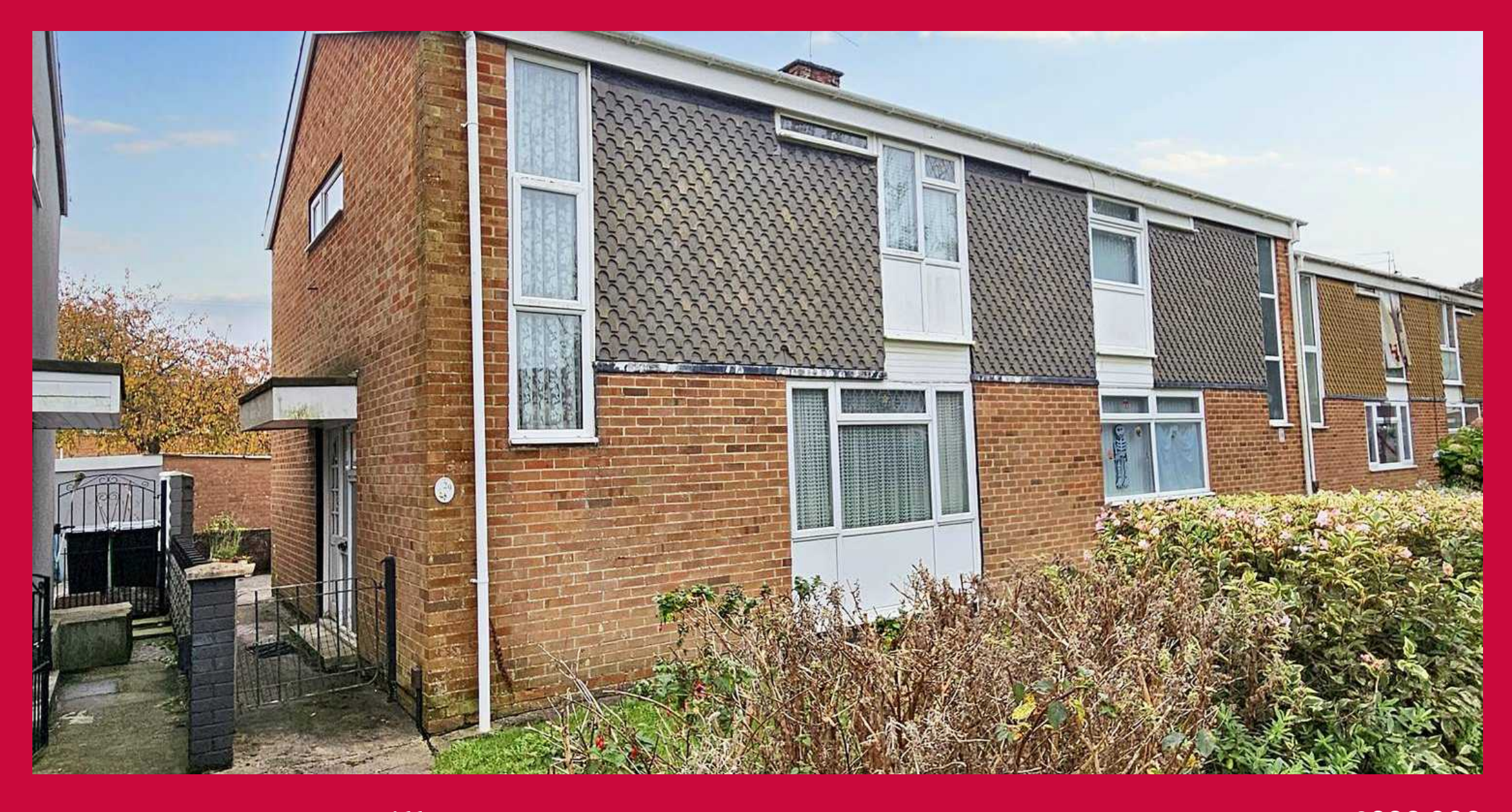
29 Hazel Place, Cardiff