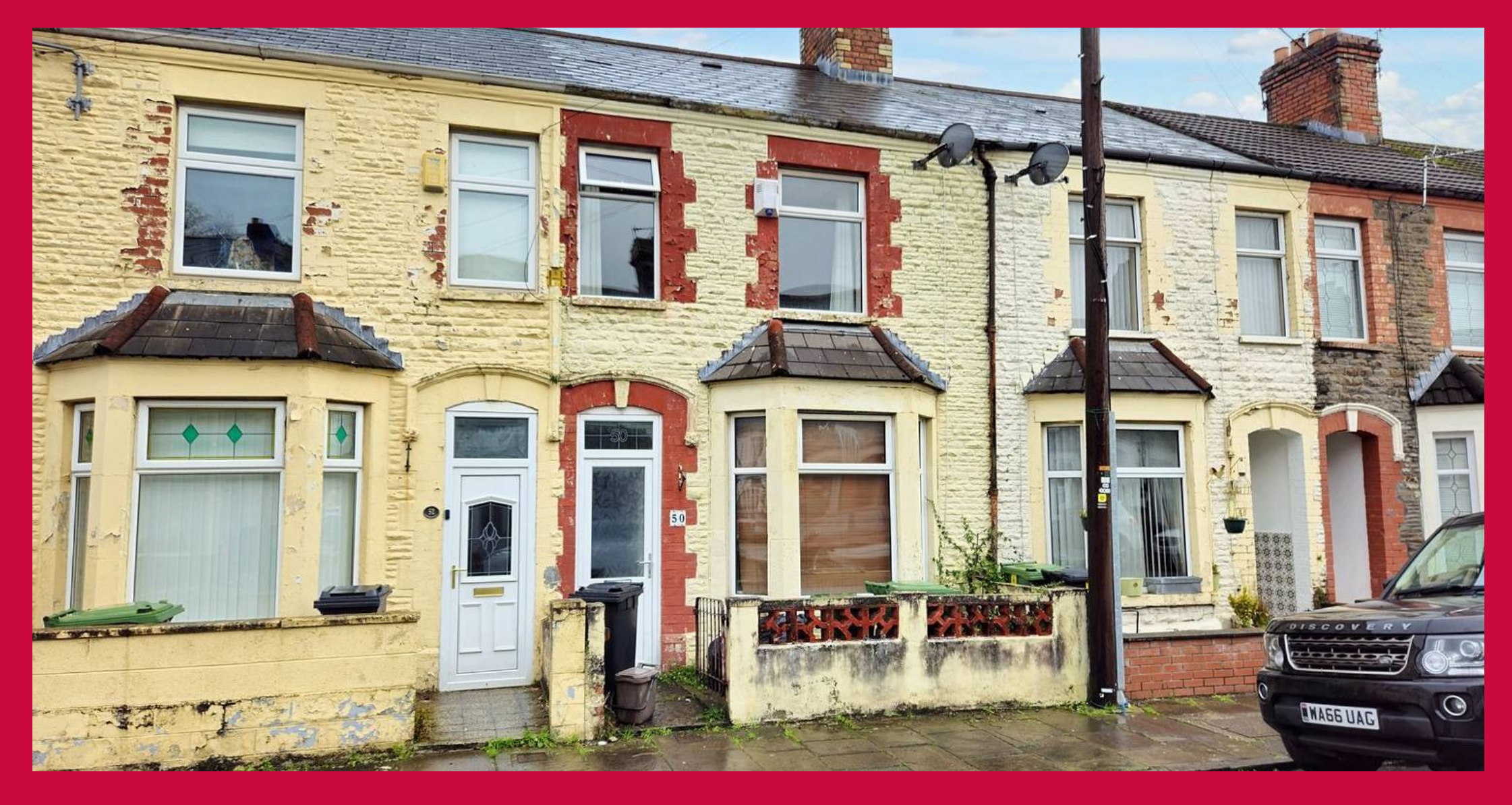
50 Aldsworth Road, Cardiff Cardiff