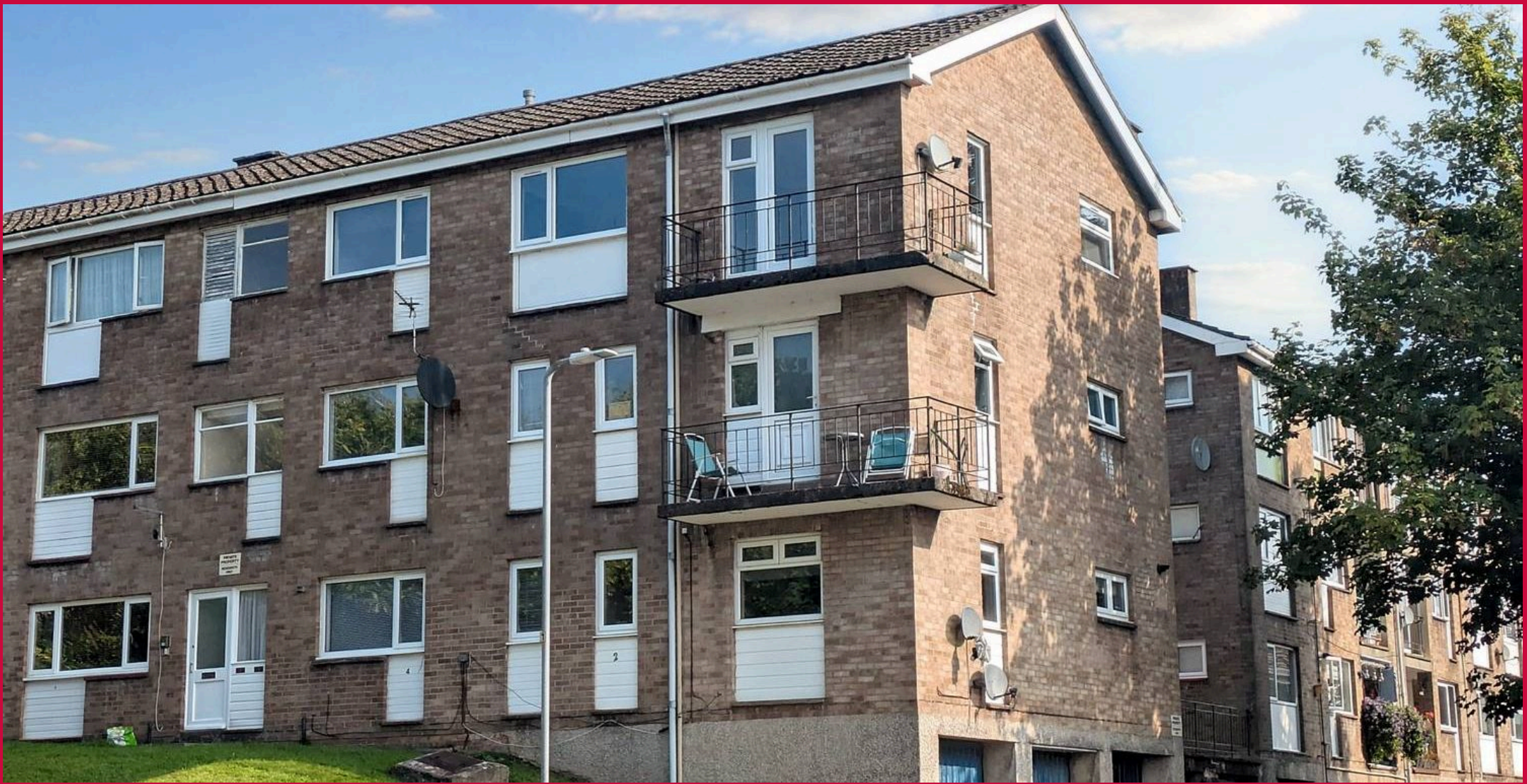
10 St. Fagans Rise, Cardiff Cardiff