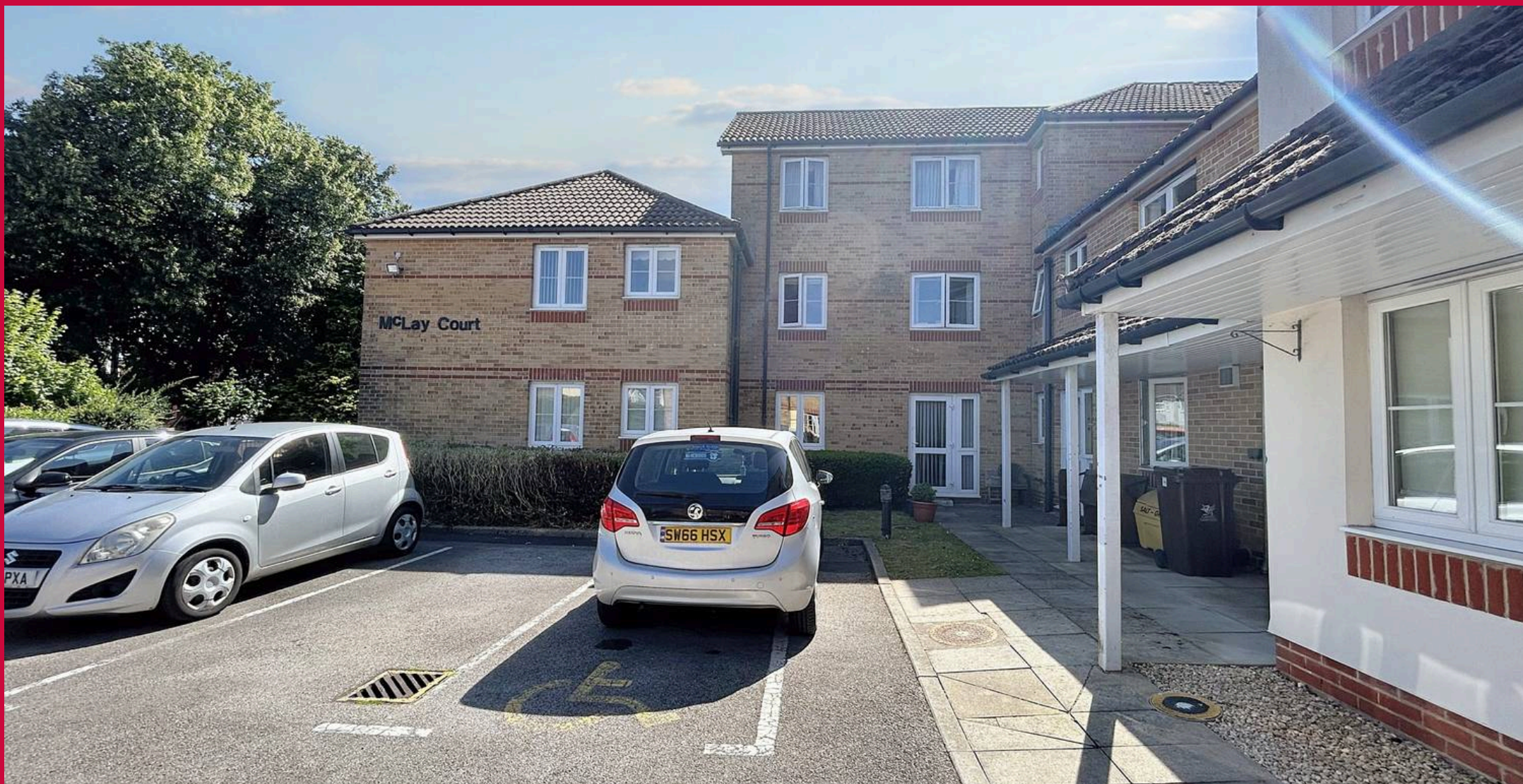
Flat 32, McLay Court St. Fagans Road, Cardiff Cardiff