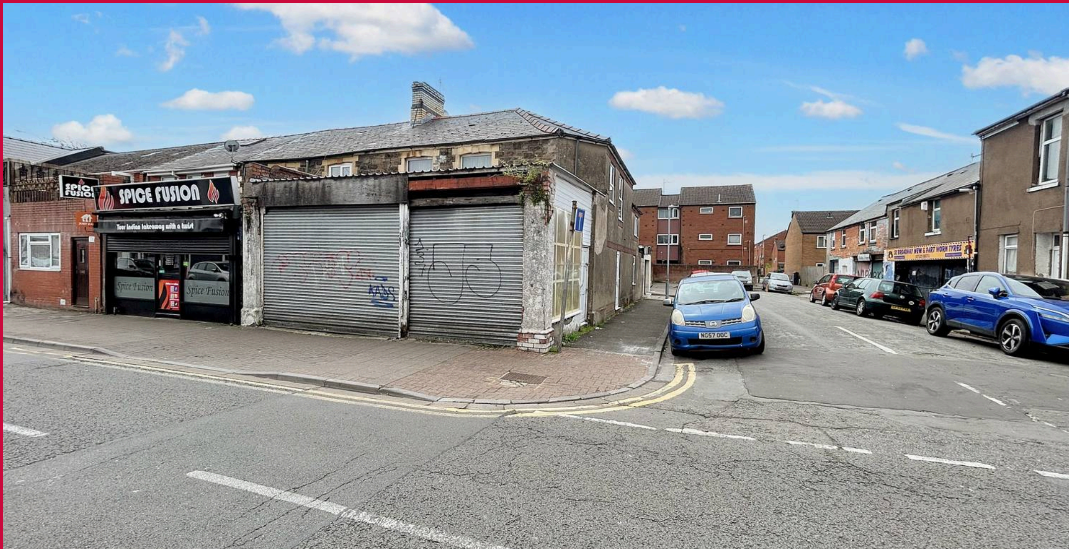
78, Broadway, Cardiff Cardiff